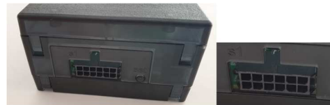
One plug for all vending machine cables